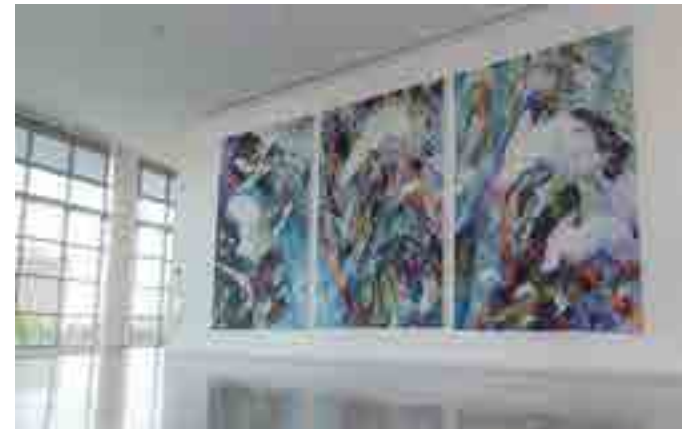
Flight of the Ibis