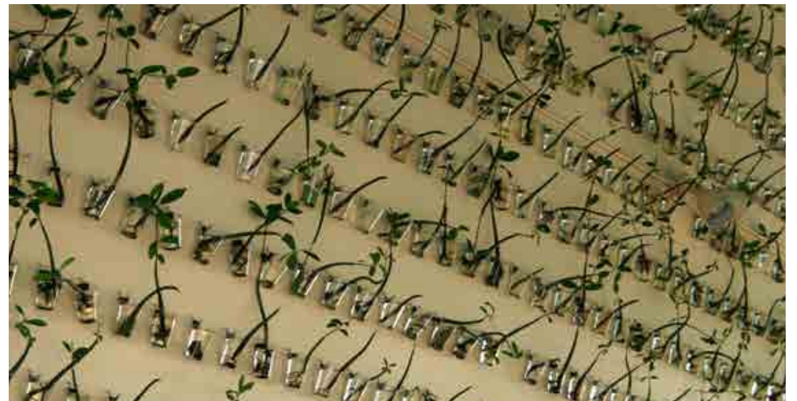
The grid of mangrove propagules at the Frost Science Museum (formerly Miami Science Museum), 2007.