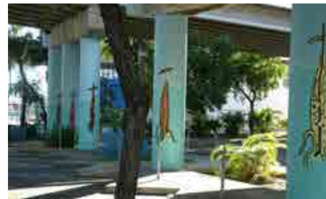
In 2004, Cortada led 800 volunteers in painting the "Miami Mangrove Forest," a metaphoric reforestation of downtown Miami where the volunteers painted Cortada's images of mangrove seedlings on dozens of columns beneath I-95.

Renée D. Ater, "Xavier Cortada: Socially Engaged Activist Artist," Painting Constitutional Law: Xavier Cortada's Images of Constitutional Rights , 2021.