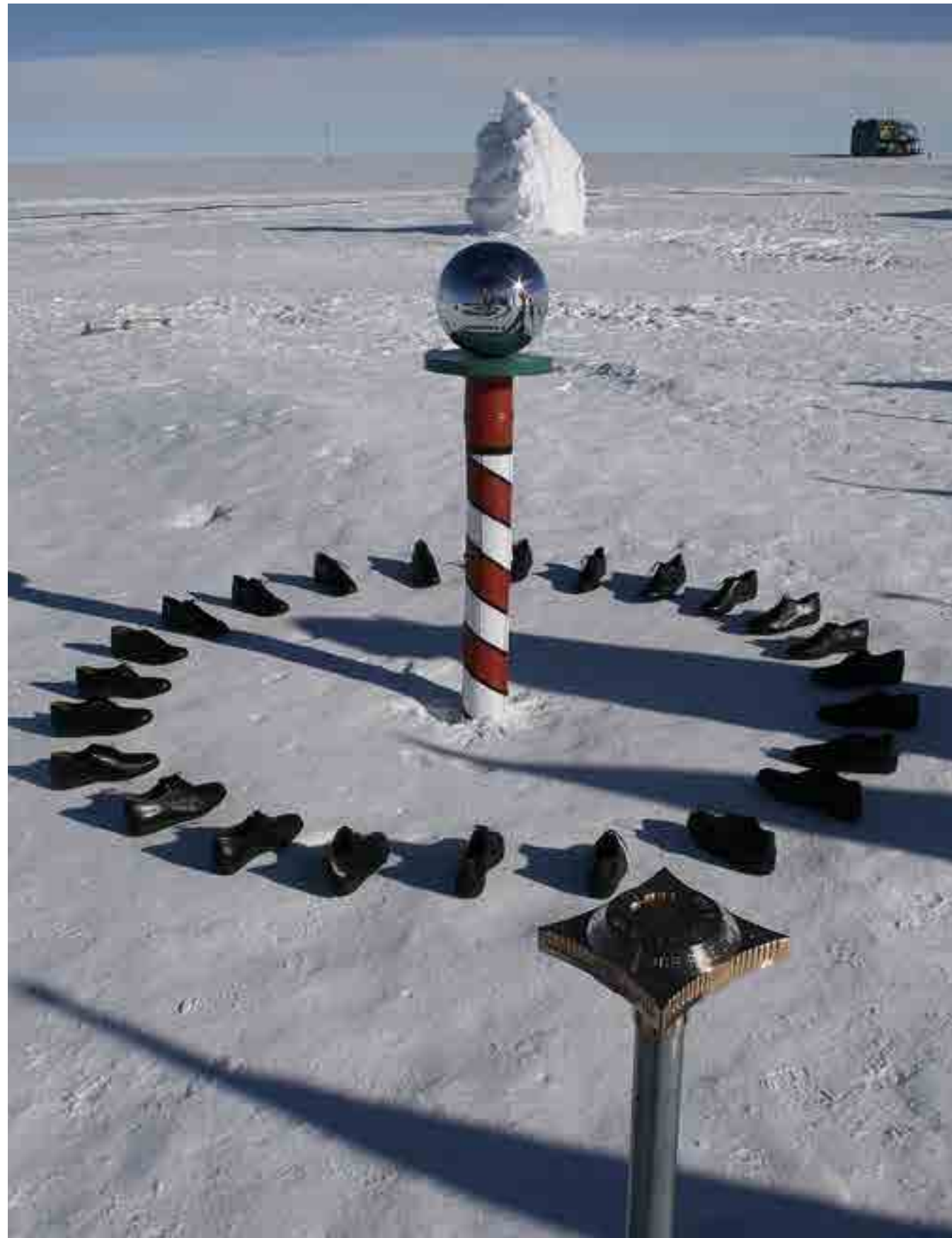
Xavier Cortada, "Longitudinal Installation," ritualistic performance with 24 black shoes in a circle at the South Pole, 2007.