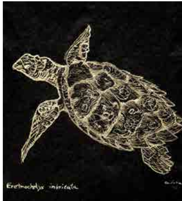
Xavier Cortada, "80.15W," 17 endangered animal drawings on carbon paper, 2010 (permanent collection NSU Museum of Art, Ft. Lauderdale, FL).