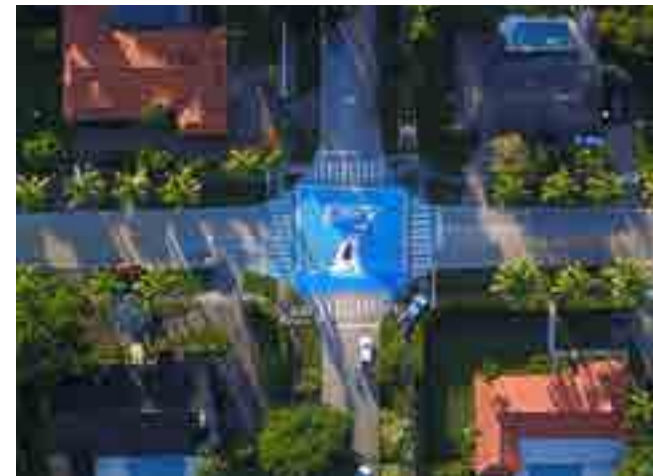
Cortada's 2018 "Underwater HOA" invited neighbors to map the topography of their community to help visualize their vulnerability to sea level rise.