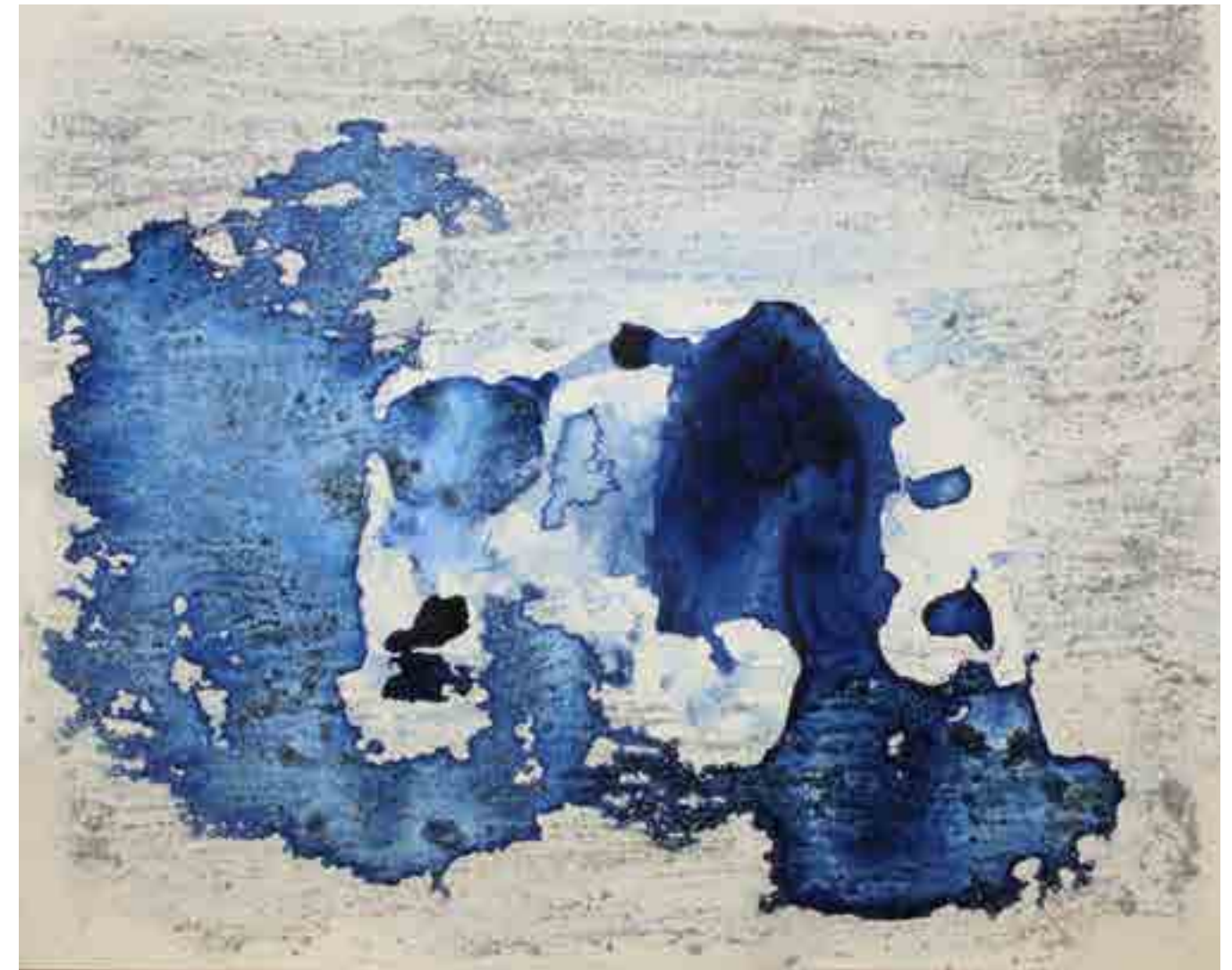
Xavier Cortada, "astrid," Ice Paintings: Antarctic Sea Ice series, Sea ice from the Antarctica's Ross Sea, sediment from Antarctica's Dry Valleys and mixed media on paper, 12" x 9," 2007 (Created onsite at McMurdo Station, Ross Island, Antarctica. Permanent collection of the Whatcom Museum in Bellingham).