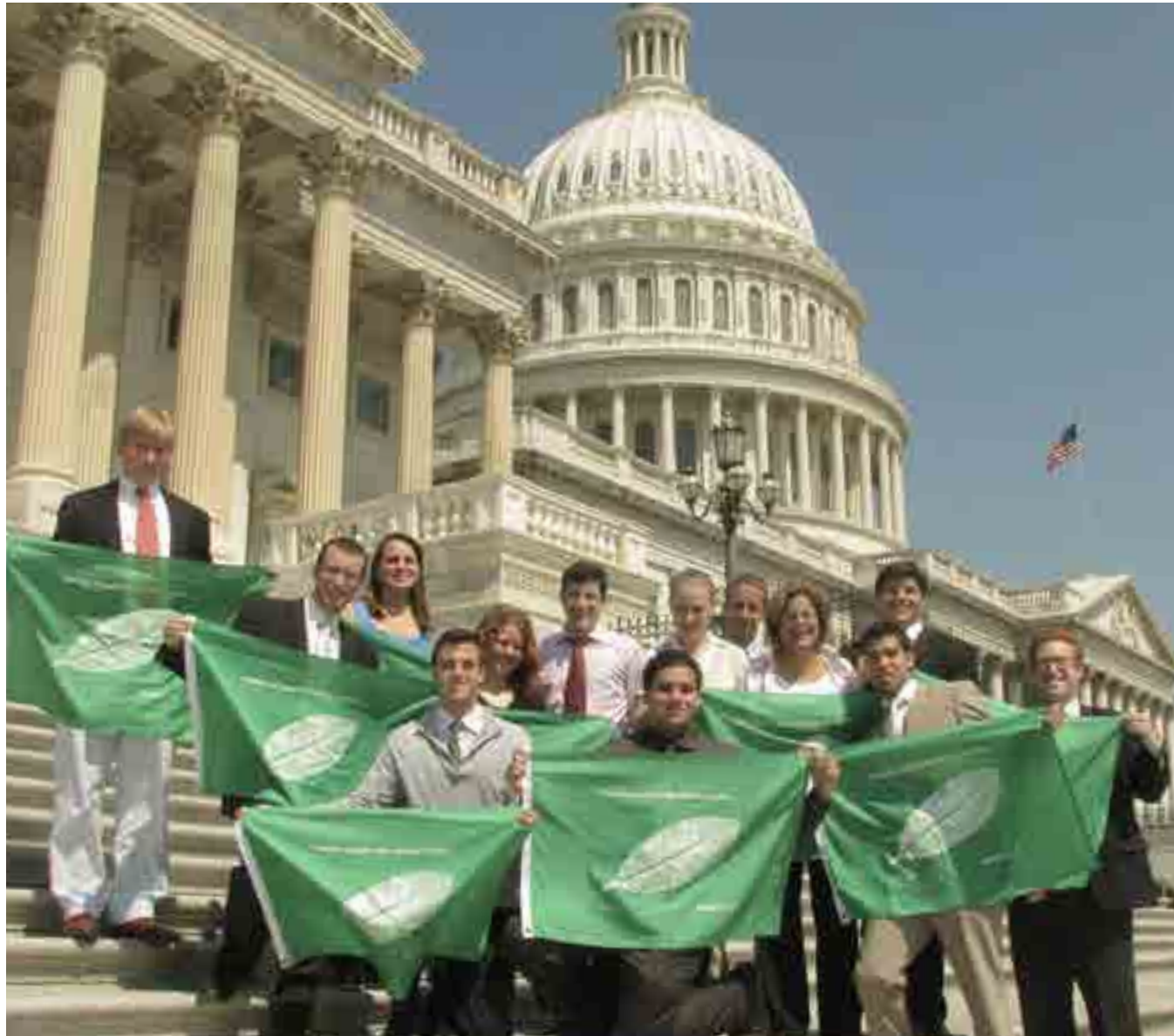
In 2008, prior to Cortada's travel to the North Pole to launch the "Native Flags" project, Congresswoman Ileana Ros-Lehtinen delivered a Native Flag to every one of her colleagues in Congress and asked them to plant the project's green flag and native tree in their respective districts across the country.