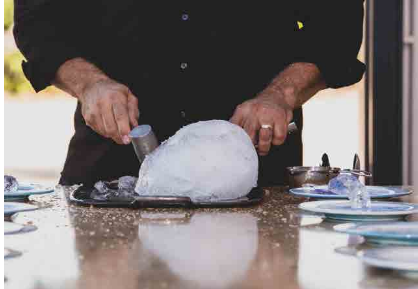
Cortada was featured in Futurescape Miami: Skyline to Shoreline , a public presentation by the Facebook Art Department and Facebook Analog Research Lab, as part of UNTITLED, ART Fair's Monuments Program during Art Basel Miami Beach 2019.