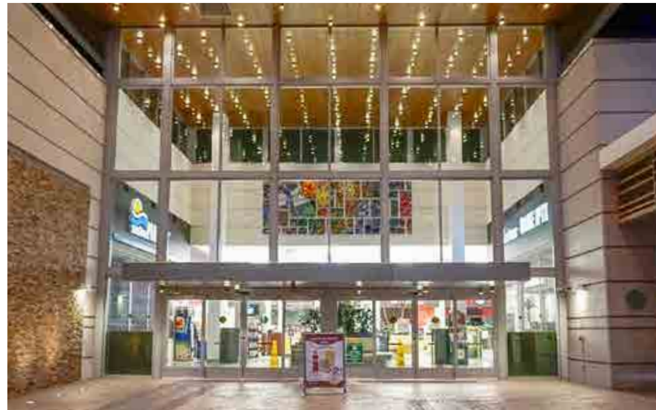
Florida Turnpike travelers entering Ft. Drum Plaza are greeted by Cortada's 20' mural of a Florida Panther.