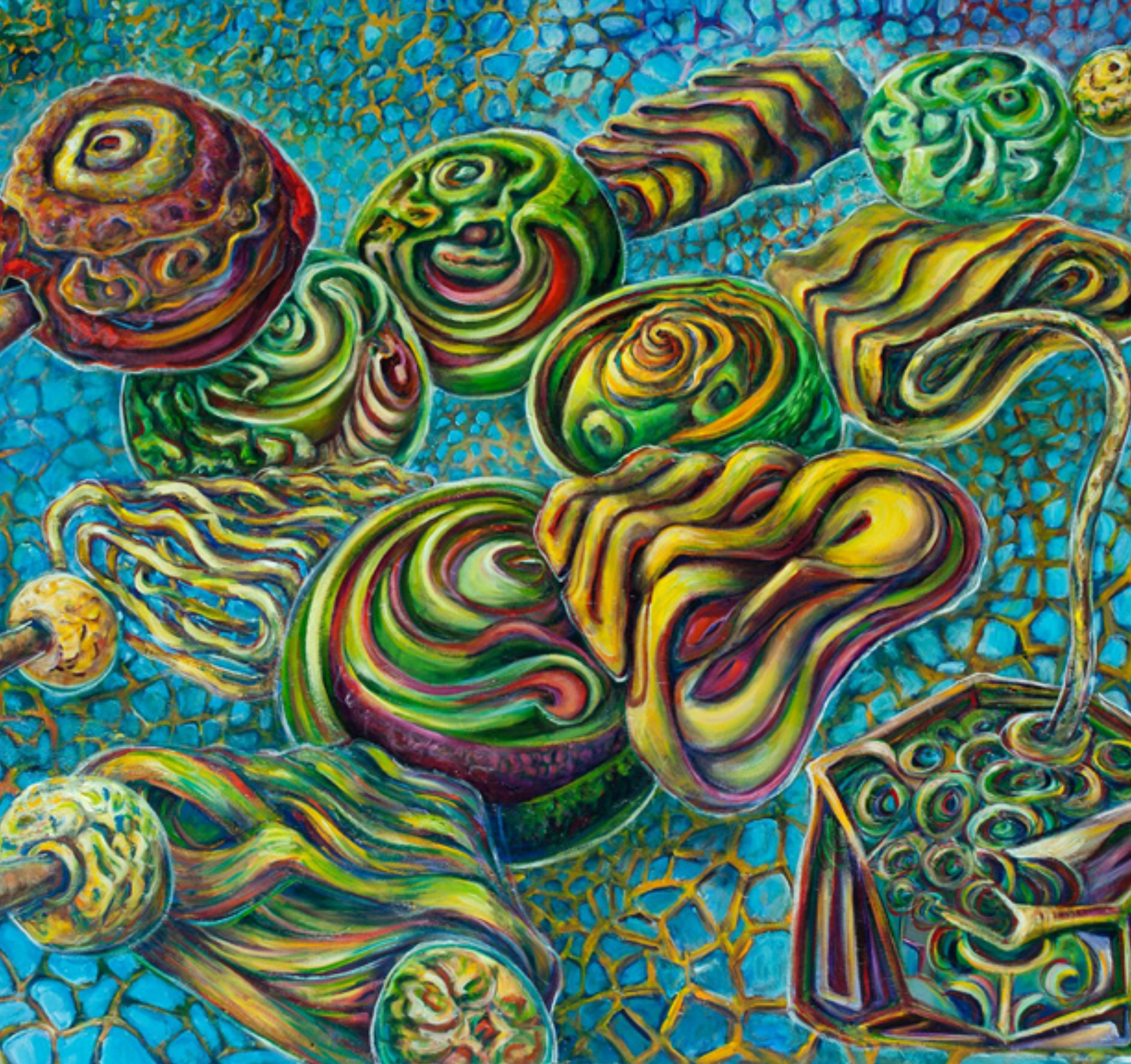
Xavier Cortada, "(The Four Nucleotides:) Guanine," acrylic on canvas, 60" x 72", 2010.