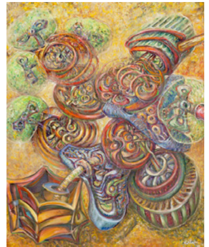
TOP LEFT: Xavier Cortada, "(The Four Nucleotides:) Adenine," acrylic on canvas, 60" x 72", 2010 BOTTOM LEFT: Xavier Cortada, "(The Four Nucleotides:) Cytosine," oil on canvas, 60" x 48", 2010 TOP RIGHT: Xavier Cortada, "(The Four Nucleotides:) Guanine," acrylic on canvas, 60" x 72", 2010 BOTTOM RIGHT: Xavier Cortada, "(The Four Nucleotides:) Thymine," oil on canvas, 60" x 48", 2010